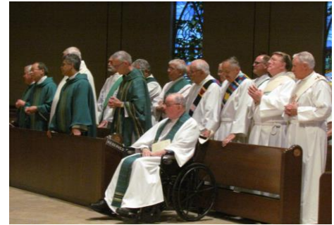
Priests and Deacons