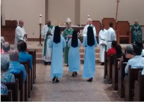
Vietnamese Nuns at Offertory